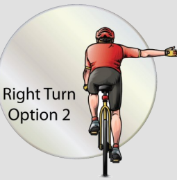
Right Turn Option 2