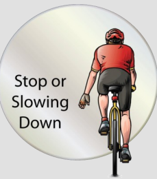
Stop or Slowing Down