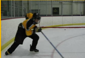
Over speed Training

Great Value – Great Programs – Great FUN!!!!