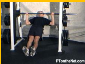
Sport Strength Training